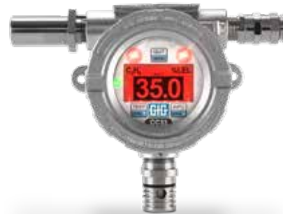
Unpainted stainless steel housing and explosion-proof buzzer

Also, in combination with GfG's powerful controllers, the CC33 is the right choice for monitoring flammable gases and vapors up to the lower explosion limit (LEL) as well as ammonia (% volume).