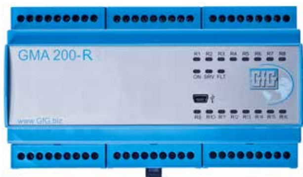
GMA 200-RT *

Click Here* for more information or to view this product on The Safety Equipment Store® website.