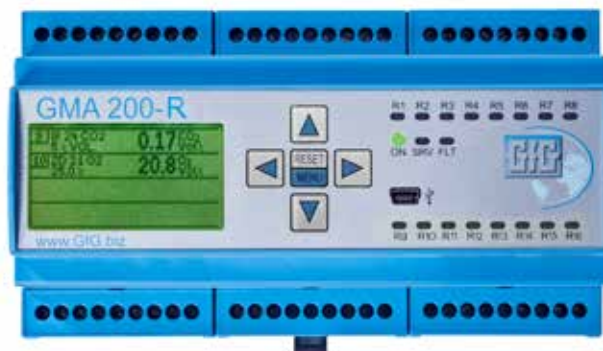
GMA 200-RTD **