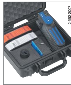
accuro® Hard Side Kit