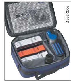
accuro® Soft Side Kit