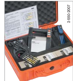
CDS/HazMat Kit with Quantimeter