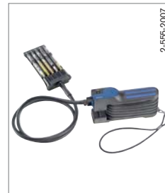
Simultaneous Test Set