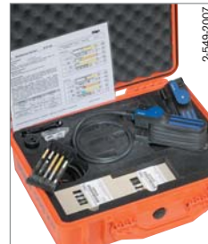
Civil Defense Simultest (CDS) Kit