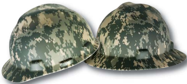
Camouflage Cap and Hat