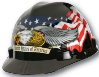
American Eagle Cap