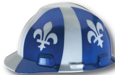
Fleur de Lys Cap