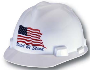
"United We Stand" Cap