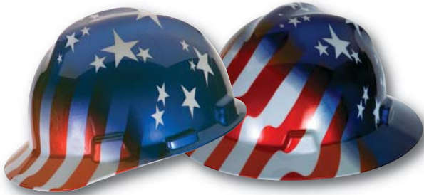
American Stars and Stripes Cap and Hat