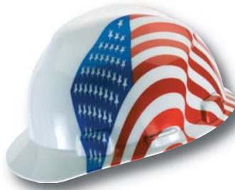
Dual American Flag Cap