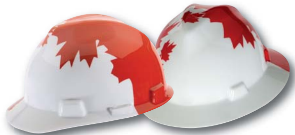
Canadian White with Red Maple Leaf Cap and Hat

Note: this bulletin contains only a general description of the products shown. While uses and performance capabilities are described, under no circumstances shall the products be used by untrained or unqualified individuals and not until the product instructions including any warnings or cautions provided have been thoroughly read and understood. Only they contain the complete and detailed information concerning proper use and care of these products.