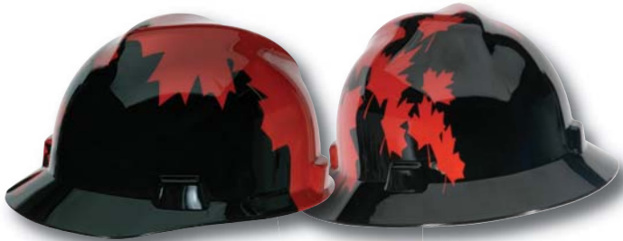
Canadian Black with Red Maple Leaf Cap and Hat