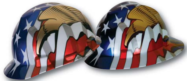
American Flag and 2 Eagles Cap and Hat